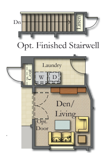
Opt. Den/Living At Bedroom #3

Main - 1,411 Sq.Ft. Garage - 477 Sq.Ft. Covered Porch - 32 Sq.Ft.